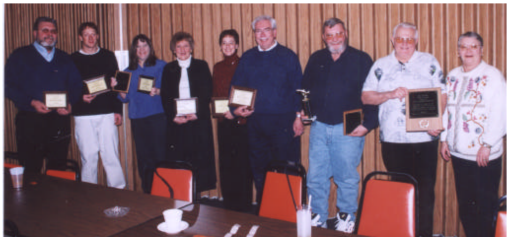
All members receiving awards at banquet