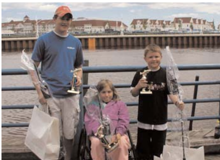
Winners of last year's Junior Coho Derby